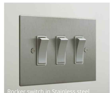
Rocker switch in Stainless steel