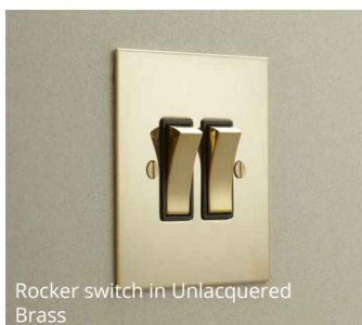
Rocker switch in Unlacquered Brass