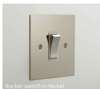
Rocker switch in Nickel