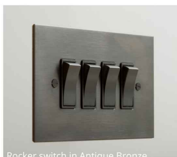
Rocker switch in Antique Bronze