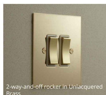
2-way-and-off rocker in Unlacquered Brass