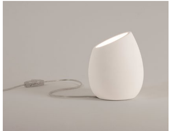
CODE: 1221001 FINISH: PLASTER

TO MAINTAIN THIS PRODUCT TO ITS BEST CONDITION, PLEASE VIEW OUR CARE AND CLEANING GUIDE ON THE SUPPORT SECTION OF THE ASTRO WEBSITE.