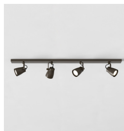
Code: 1487004 Finish: Bronze