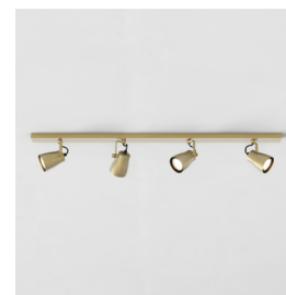
Code: 1487008 Finish: Matt Brushed Brass

To maintain this product to its best condition, please view our care and cleaning guide on the support section of the astro website.