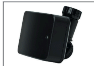
Q-Nex PLUG & PLAY TECHNOLOGY Photocell Sensor AFL/PCCELL/BK