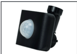
Q-Nex PLUG & PLAY TECHNOLOGY PIR Sensor AFL/PIR/BK