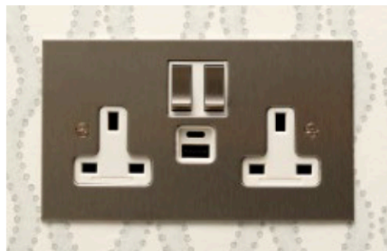
13amp Socket Outlet with Type A and Type C USB in Stainless Steel