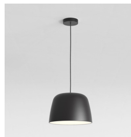
Code: 1456009 Finish: Matt Black