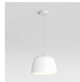
Code: 1456010 Finish: Matt White

To maintain this product to its best condition, please view our care and cleaning guide on the support section of the astro website.