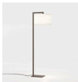
Code: 1222091 Finish: Bronze