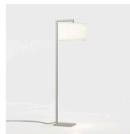
Code: 1222092 Finish: Matt Nickel