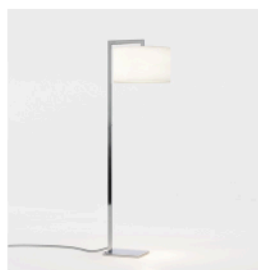
Code: 1222093 Finish: Polished Chrome

To maintain this product to its best condition, please view our care and cleaning guide on the support section of the astro website.