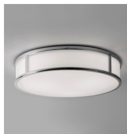
CODE: 1121026 FINISH: POLISHED CHROME