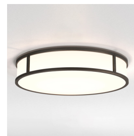
CODE: 1121085 FINISH: BRONZE

TO MAINTAIN THIS PRODUCT TO ITS BEST CONDITION, PLEASE VIEW OUR CARE AND CLEANING GUIDE ON THE SUPPORT SECTION OF THE ASTRO WEBSITE.