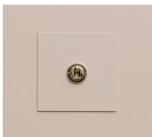
1 Gang Dolly Switch