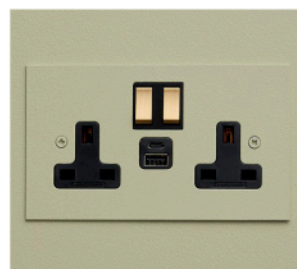
Double Socket with USB A&C Metal Rockers and black insert square edge