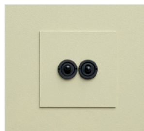
2 Gang Dolly Switch