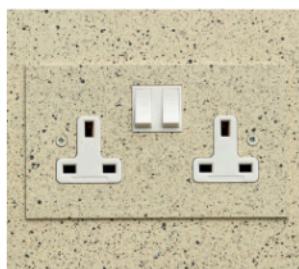
Double Socket with white insert square edge