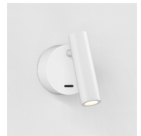
CODE: 1058225 FINISH: MATT WHITE

TO MAINTAIN THIS PRODUCT TO ITS BEST CONDITION, PLEASE VIEW OUR CARE AND CLEANING GUIDE ON THE SUPPORT SECTION OF THE ASTRO WEBSITE.