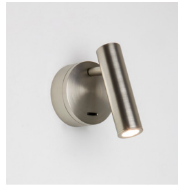
CODE: 1058013 FINISH: MATT NICKEL