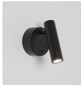
CODE: 1058027 FINISH: MATT BLACK