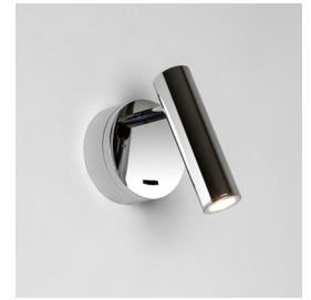
CODE: 1058014 FINISH: POLISHED CHROME