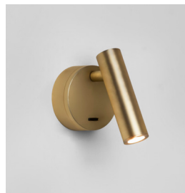
CODE: 1058108 FINISH: MATT GOLD