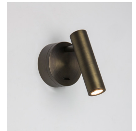
CODE: 1058084 FINISH: BRONZE