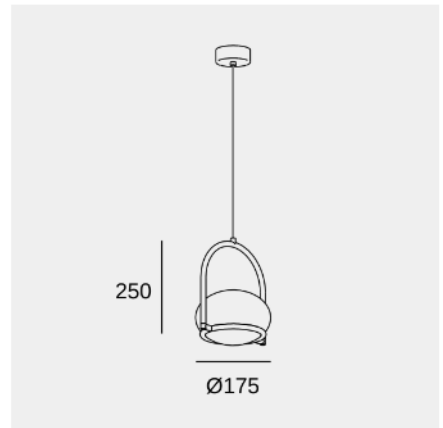
Image may not match reference. LedsC4 reserves the right to amend any of the product's components. The data related to flux, power and colour temperature may be subject to changes made by the manufacturer.